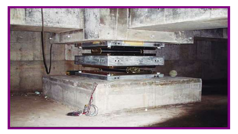
Fig 4: Roller & Ball Bearing Based Isolated Structure

Roller and ball bearings are used in bridges and in machinery isolation to a large scale bearing. It consists of cylindrical rollers and balls and is sufficient to resist horizontal movements and damping depending on the material used. This can be easily applied in base isolation without any changes in design ,shape or technology.