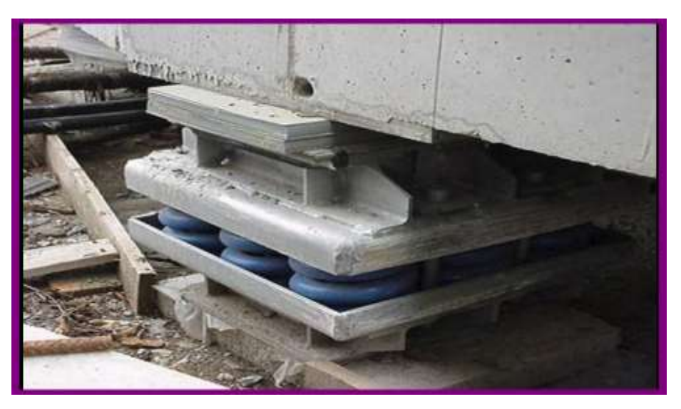
Fig6: Steel Spring Based Isolated Structure

Steel springs are heavy-duty isolators used for building systems and industry. Additional isolation is achieved by steel spring mounting on a concrete block. Both horizontal and vertical vibrations are controlled since these are flexible in both directions.