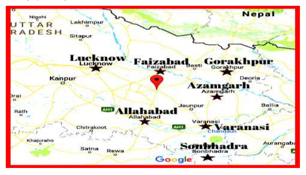
Fig 7: Map of Eastern Uttar Pradesh Showing Selected Locations

The Eastern Uttar Pradesh falls in a region of moderate to high seismic hazard. Historically, parts of this region have experienced seismic activity in the magnitude range 5.5-8.0. Approximate locations of selected cities/districts and basic political state boundaries along with Nepal, which is the major source of earthquake in this region are displayed in figure 7.