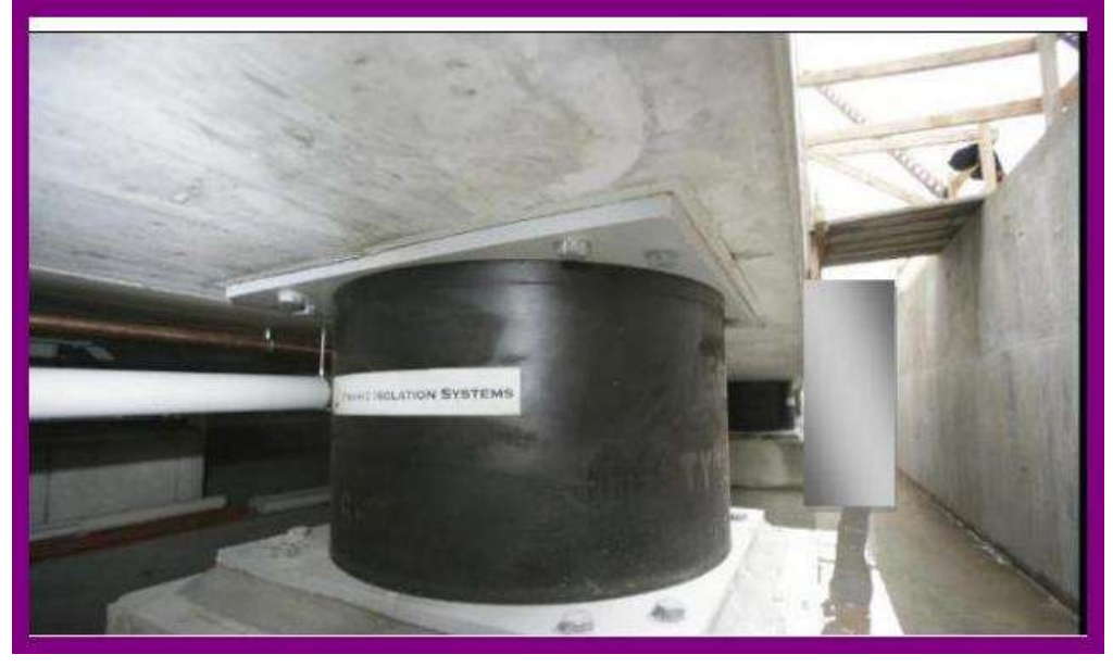
Fig2: Principle of Base Isolation System

ISSN: 2277-9655 Impact Factor: 4.116 CODEN: IJESS7