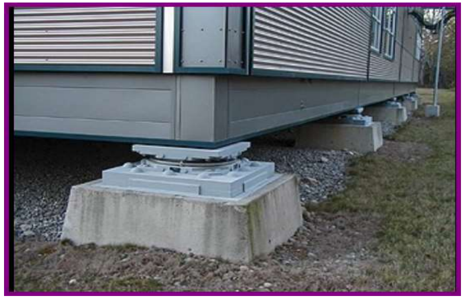
Fig5: Sliding Bearing Based Isolated Structure

ISSN: 2277-9655 Impact Factor: 4.116 CODEN: IJESS7